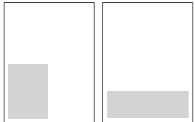
Quarter Page (Vertical)